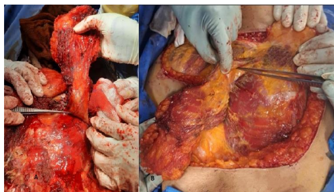
Figure 3 A,B : Marking of the PMMC flap island