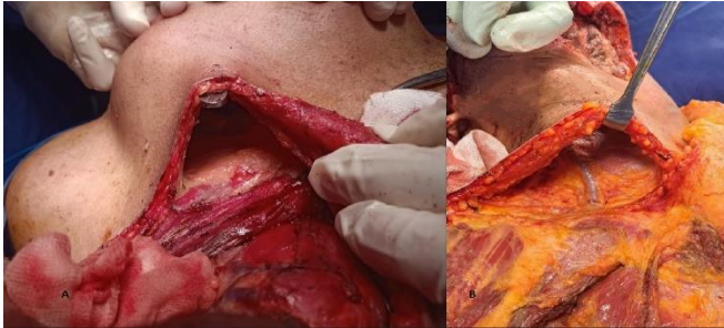
Figure 5 A,B : Creation of SC tunnel for flap transfer to the neck