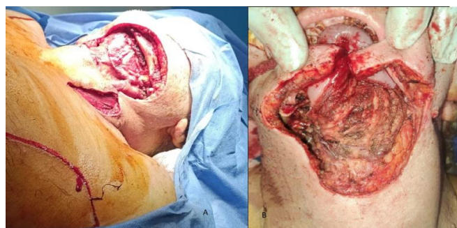
Figure 2 A,B : Radical excision of the tumor