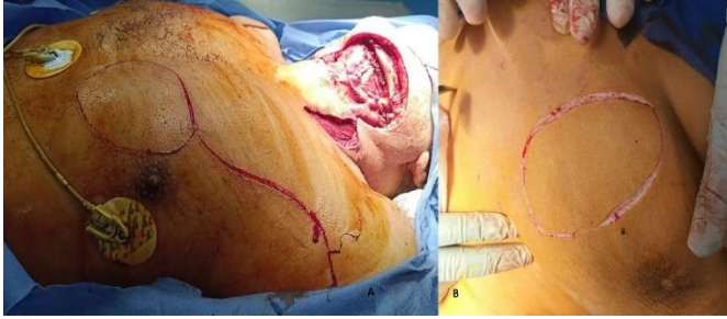
Figure 4 A,B : PMMC flap dissection and mobilization